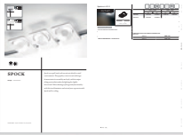
TRACK - P425