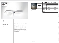
WALL - P485